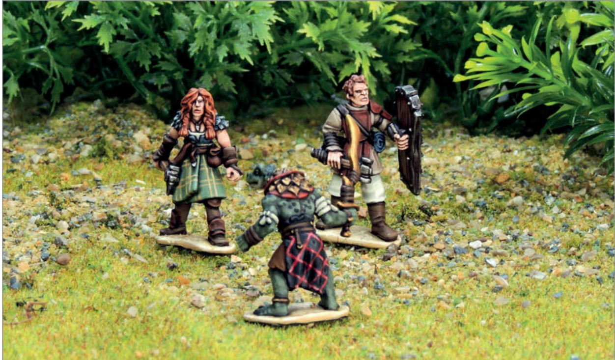
Lost Colossus Random Encounter Table