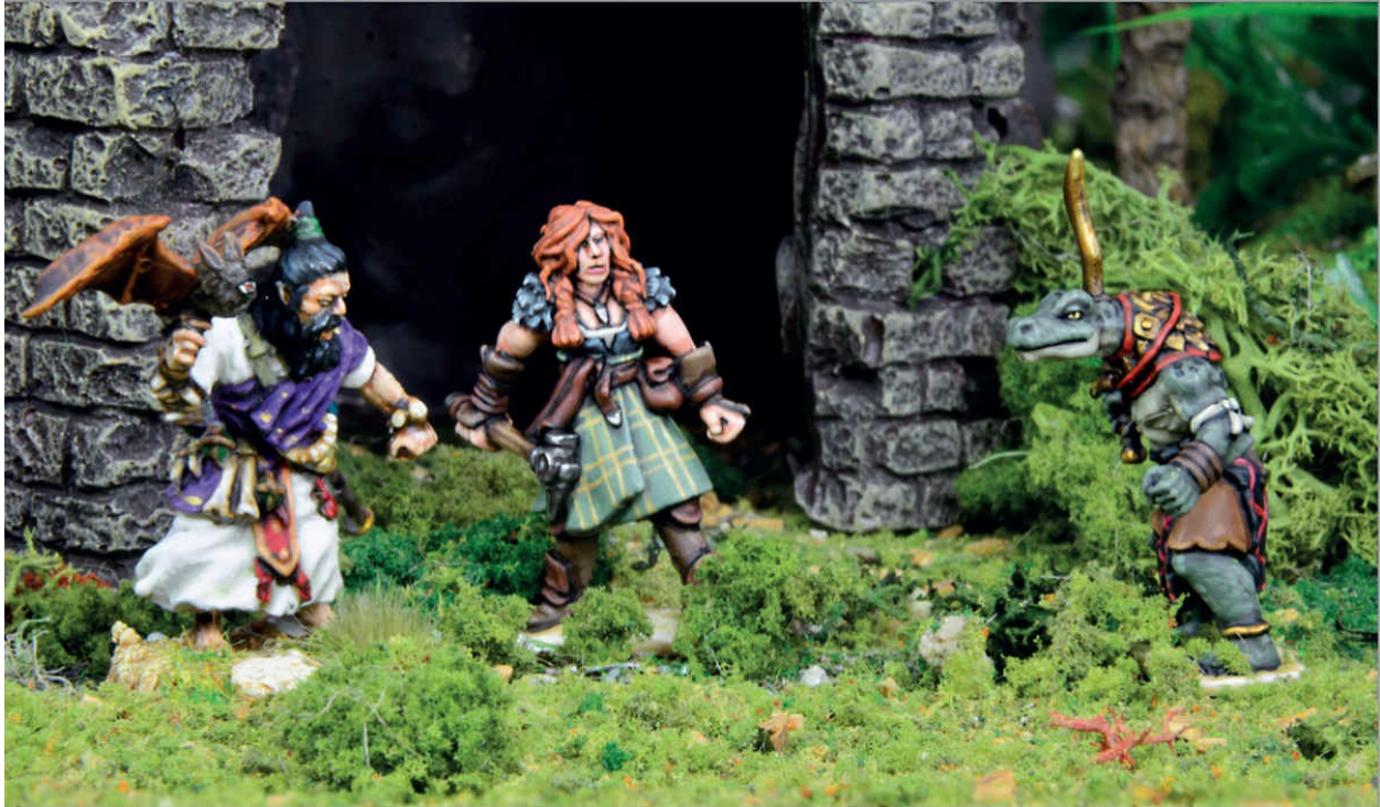
Lost Colossus Treasure Table