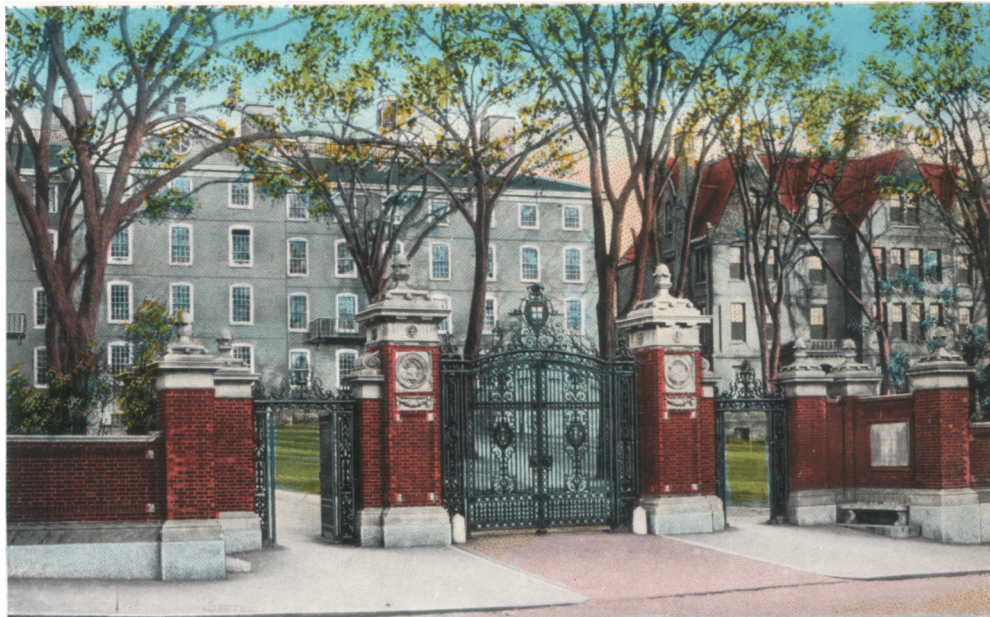
VAN WICKLE GATES, BROWN UNIVERSITY, PROVIDENCE, R. I.