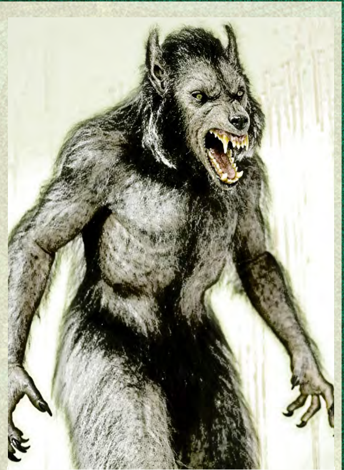
LOUP-GAROU (DEMON WOLF)

Unlike weres loup-garous are immune to the effects of silver, since they are beasts in nature and are not the product of corrupting dark forces. They do not change with the cycles of the moon, can transform at will (taking about 60 seconds), and have complete control of their actions while in wolf form. What makes them dangerous is the fact that while in their wolf form they are as self-aware as they are when in human form having complete access to their human thoughts, memories, and knowledge. This, with the enhanced abilities of a giant wolf, makes them worthy as darkling prey for the prepared Minion Hunter.