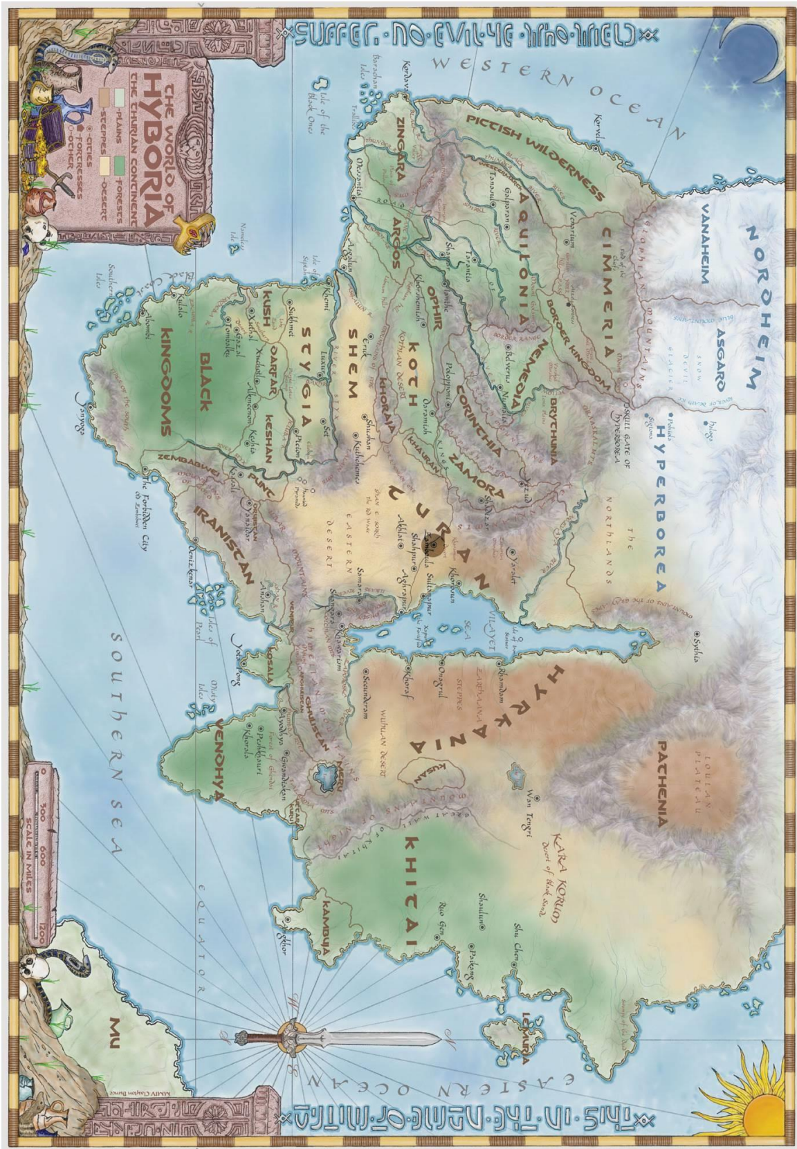
Figure 0: The World Map—Zamboula, Turan