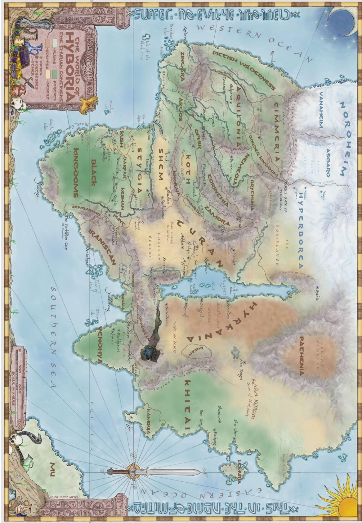
Figure 0: World Map Hyrkania