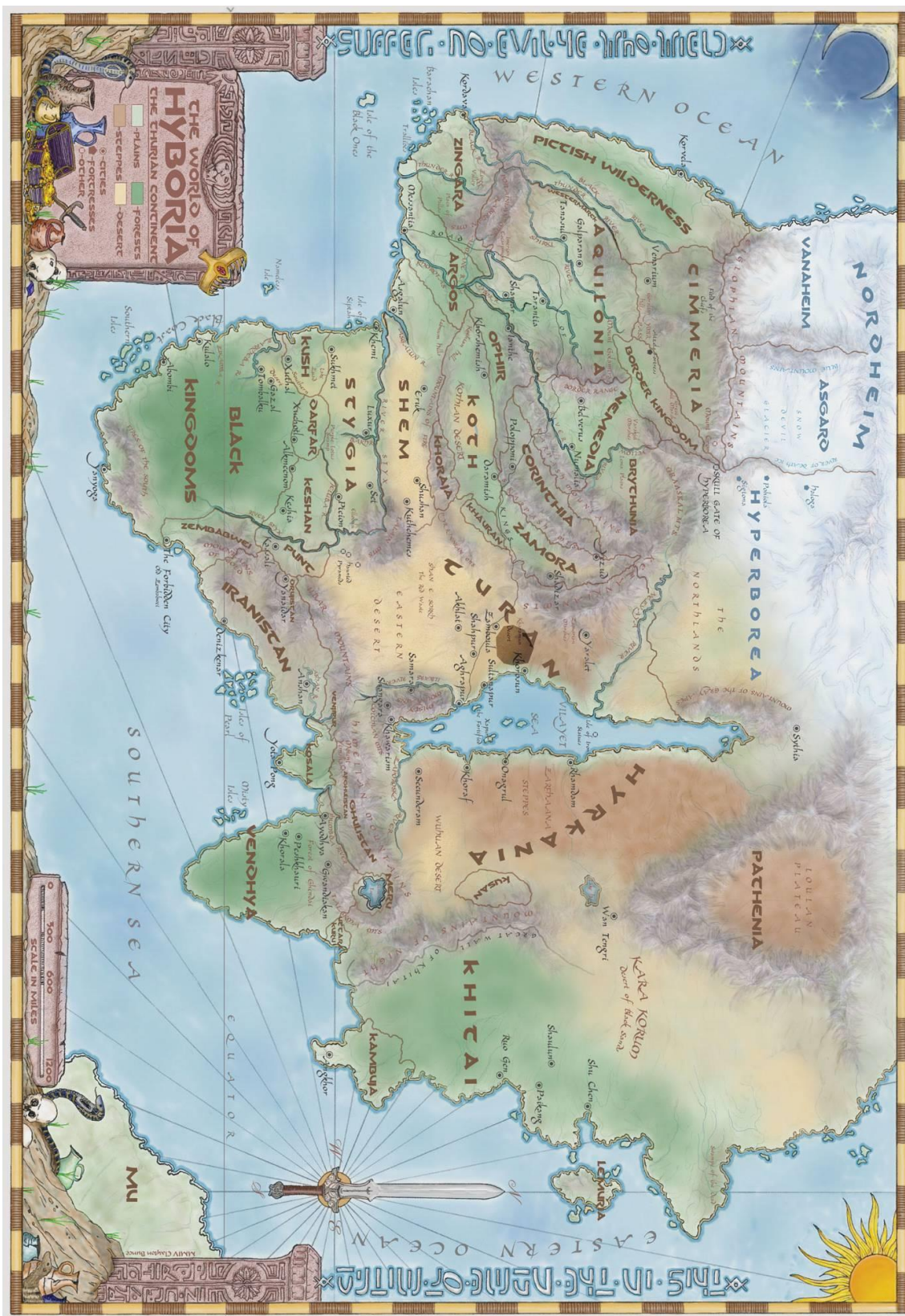
Figure 0: The World Map Turan