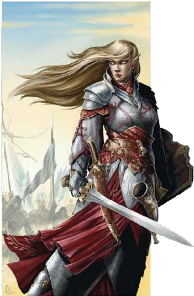
An eladrin marshal stands ready for battle

Your choice for the Commanding Presence class feature is a good indicator of which powers you should start with. Choosing Inspiring Presence implies that you