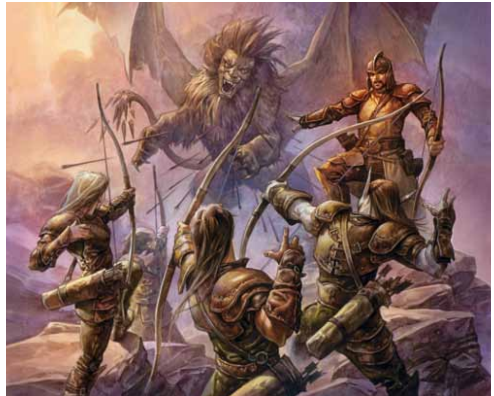
A warlord and his archers give the mantichore a taste of its own medicine

Effect: You slide the target a number of squares up to your Intelligence modifier, but not into hindering terrain.