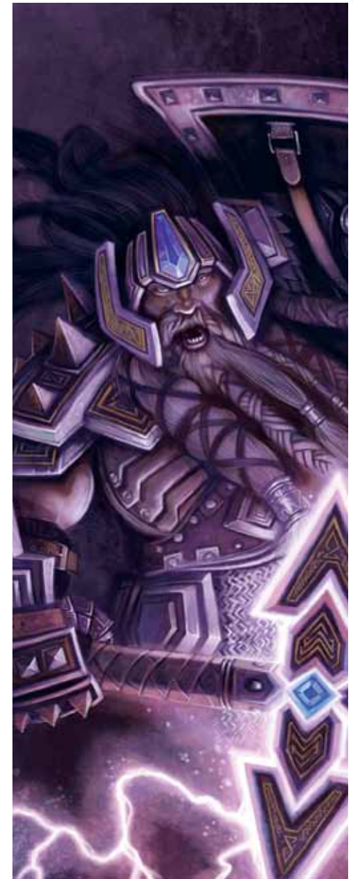
A dwarf warlord

Your trained skills should reflect your interests and background. If, for example, you choose Athletics and Endurance, you might have spent your earlier life in the field, learning to lead by taking the battle to