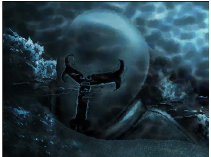
The final fate of Talos the Triple Golem beneath the waves?

Long lost, it is now whispered that the treacherous drow clerics beneath the Hellfurnaces seek to recover the staff to gain favour with their dark queen. It is believed that only a drow high priestess may safely employ the powers of the staff, but the consequences of such employment are unknown (but believed to be dire).