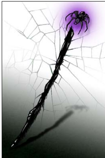
The Spider Staff of Jelinith.

A renowned olven battle-duke named Nelikos recounted the tale of a great battle underneath what is now the nation of Celene, in which Jelinith was able to command great powers that defied simple comprehension. Nelikos described the staff as perhaps six feet long, tipped with an animated black spider. The staff was able to turn away much of the defending army in terror, a terror that resisted divine restoration. The device was seemingly able to conjure great masses of webbing that was literally swarming with venomous spiders. Nelikos watched as the high olven champion Olifrey was able to seize the device briefly, but the spider at the top of the staff grew to a tremendous size and tore him apart. Disheartened, Nelikos ordered a retreat, yet not before he saw many of his fallen colleagues transformed into the hateful drider abominations.