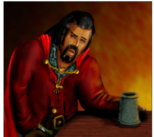
Sir Pothanc's cloak opened slightly and his holy symbol hung loosely about his neck, six arrows clenched in a mailed fist.