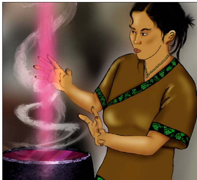
Ecjoy, priestess of Olidammara, changes water to wine for an upcoming festival.

When Olidammara was trapped by Zagyg, the Mad Archmage forced him into the shape of a animal with a carapace as