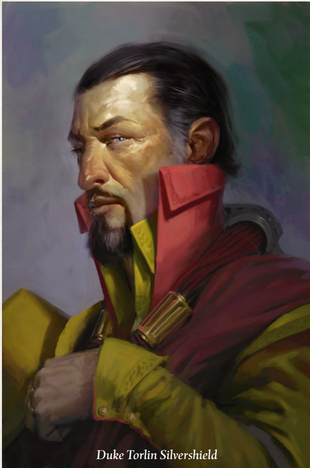
Duke Torlin Silvershield

and he deals with stress by avoiding it. As a leader, Grand Duke Portyr is a weathercock, turning wherever the wind blows.