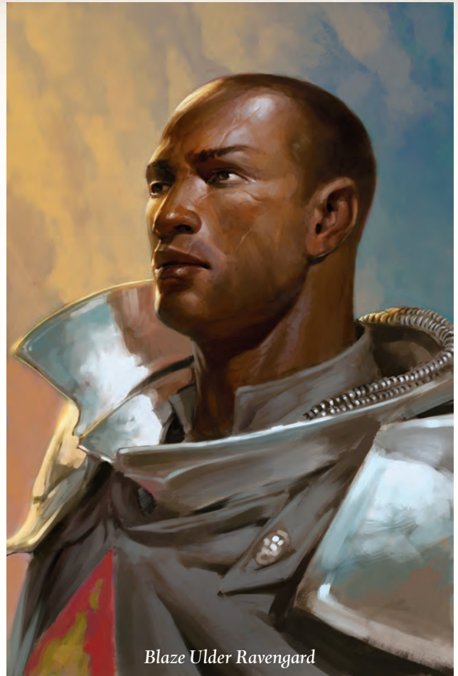
Blaze Ulder Ravengard

After living in contemplation in Candlekeep for a time, Abdel eventually settled in the city that had been his second home. He joined the Flaming Fist as a private but quickly ascended through its ranks to a blaze,