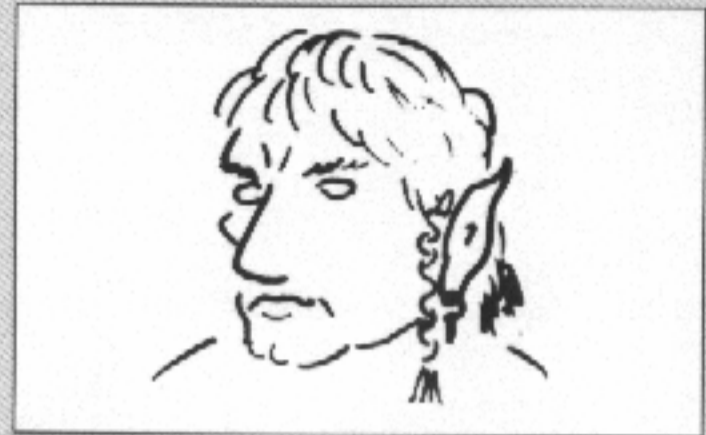
Character Sketch or Symbol