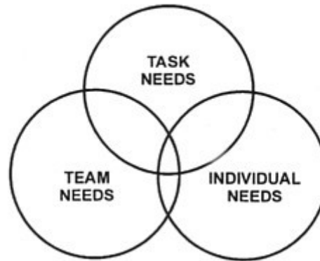
The Three Circles Model

The above diagram shows the interaction of three areas of need within a group: Task Needs, Group Maintenance Needs, and Individual Needs. These three areas of need are interdependent. For example, if there is a lack of trust and mutual understanding within a group, this will affect both task performance and individual needs. If individuals within the group do not feel that their contributions to the group as a whole are valued, then they will be less likely to contribute to the group's common task, and the 'we-ness' of the group will also suffer. Conversely, if a group has a well-developed sense of team spirit, it is more likely to rise to the challenges of its chosen tasks, and individual members will feel more personal satisfaction from being involved with the group. The question for the leader is, how to contribute to these three areas of need? To be effective, the leader must firstly, be aware of what is going on in the group (both on the surface and the underlying dynamics); secondly, have an understanding of what is required at any given moment; and thirdly, the skill to put what needs doing into effect. The effectiveness of the leader's actions can be evaluated on the basis of how much the group responds. In terms of the 3 circles, the leader's task is to (a) achieve the task (b) build and maintain the team (c) respect and develop individual members.