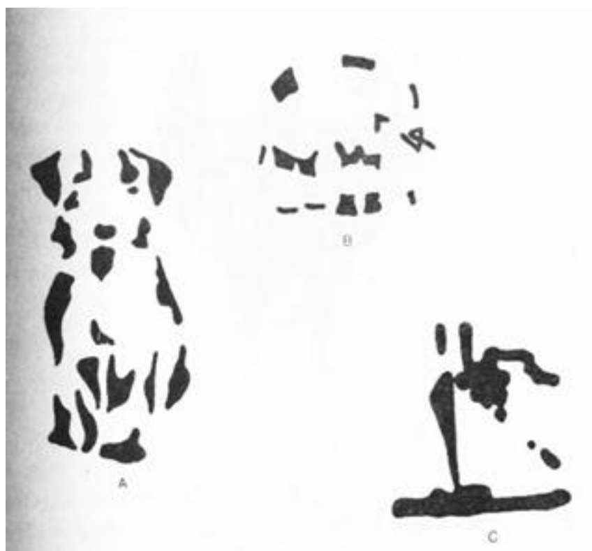
Figure 5. 1. Incomplete figures

It also is easier to perceive the familiar than the unfamiliar. Study Figure 5.1 until you have identified all three elements. How long did it take you to identify each of the three figures? You probably identified the dog first, then the ship, and finally the elephant. This corresponds to the relative familiarity of the three images. The familiar, of course, is the expected.