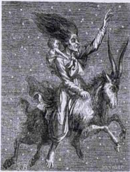
Transport of Sorcerers