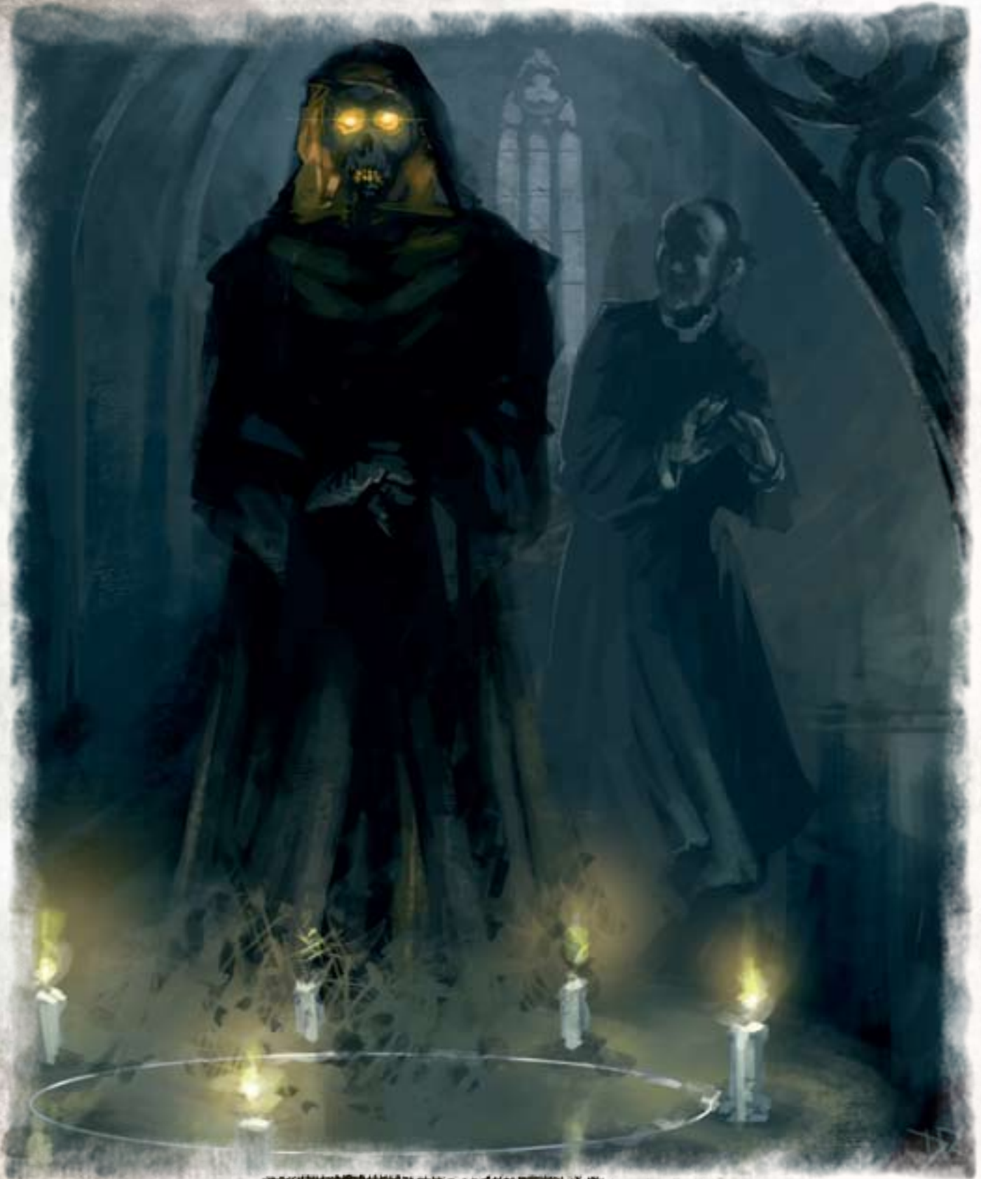
THE BLACK JUDGE