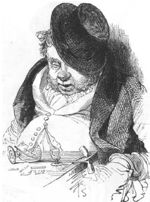
Klesbu still retains the highest number of lay worshippers

"Why do you vacillate? I merely wish to venerate Klesbu at the two-fold temple? What could be more pure?"