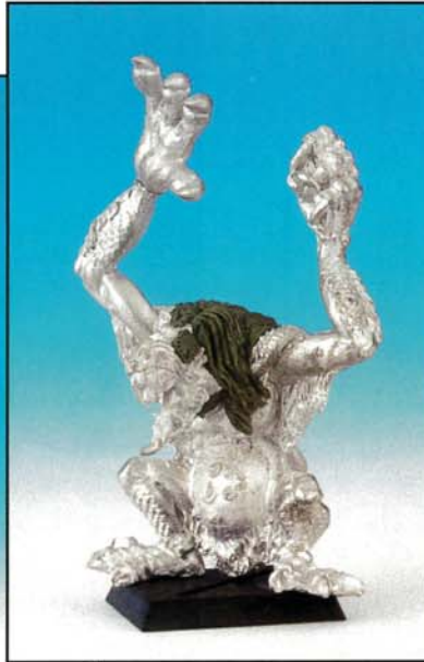
Two of Mark's Possessed conversions

Trainee Miniature Designer Mark Bedford has created two towering Possessed miniatures. Mark's first model is made up of as diverse a collection of different parts as you could ask for! The miniature is built upon the torso of a Rat Ogre, with the legs of a Slaanesh Steed and a Daemon Prince tail. The right claw is actually a Chaos Spawn 'Head'. The head has been extensively filed down but is in fact a complete Chaos Dragon head, cut off at the neck and modelled up with Milliput, a type of two part modelling putty. The rest of the model has extra detail sculpted on with Citadel Modelling Putty.