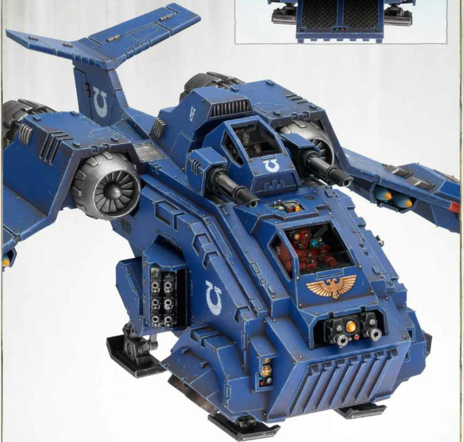
Stormraven Gunship with twin-linked lascannon, twin-linked heavy bolter and hurricane bolters