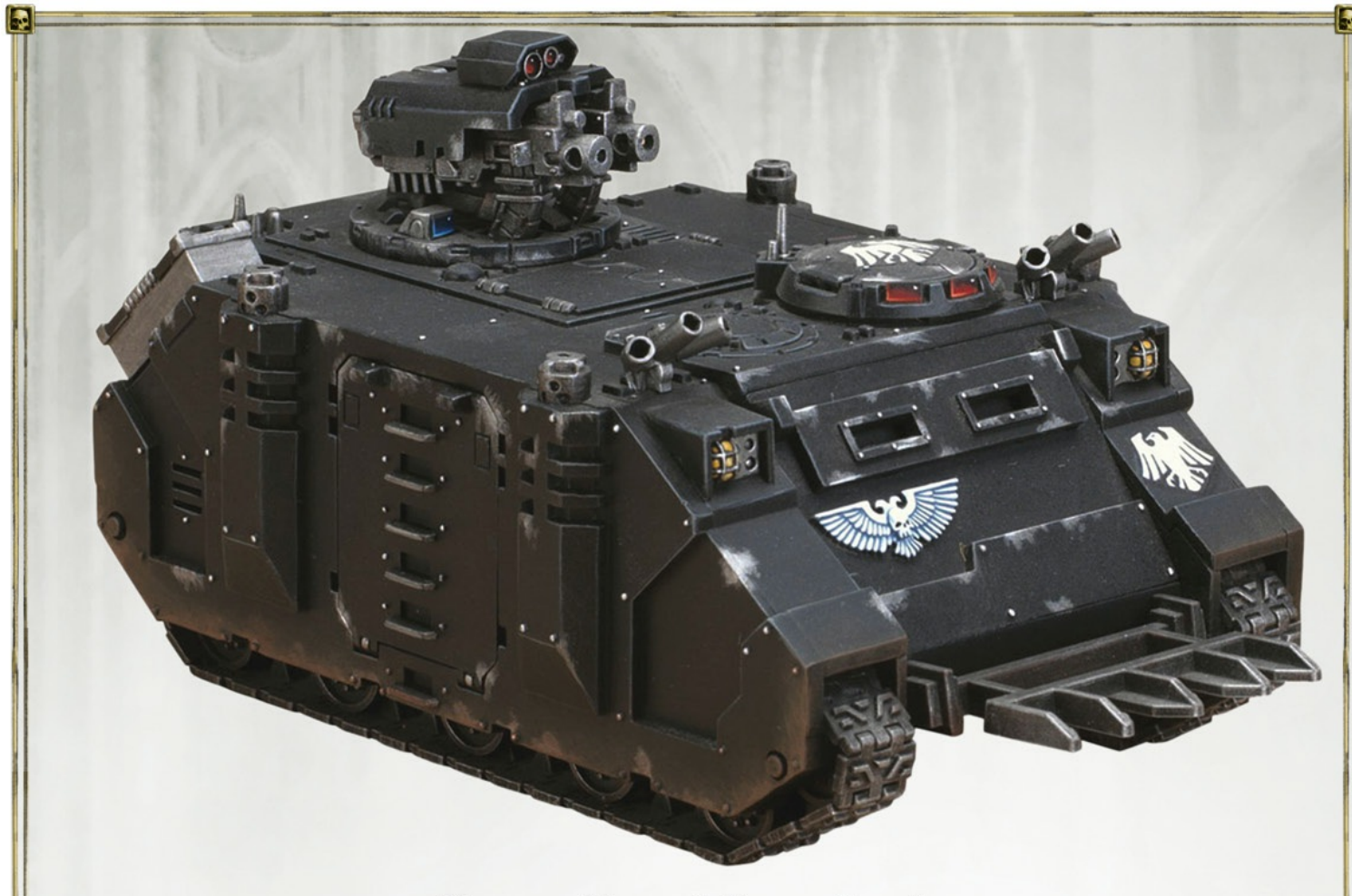
Raven Guard Razorback