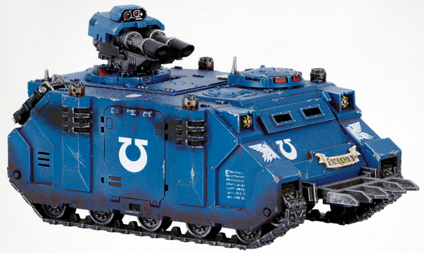
Ultramarines Razorback with Twin-linked lascannon