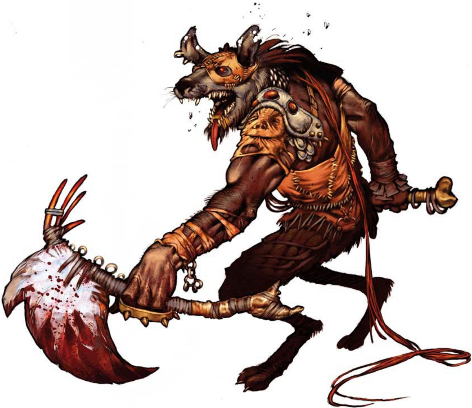
CAPTAIN GNARL BONEGATHER