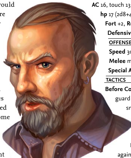
First Mate Marzack Mallick

Creatures: Marzack Mallick, first mate of the Throaty Mermaid , emerges from the lower decks, followed by his accomplice. See the Dramatis Personae for combat statistics for the five possible murderers. Marzack begins the encounter feigning interest in the PCs' well-being, inquiring about their injuries and taking the opportunity to assess their weaknesses. Marzack's true intention is to kill the PCs while they are alone on the main deck and before they can fully recover from the sudden squall. Should the PCs accuse Marzack of treachery, he and his accomplice immediately attack. Otherwise, they position themselves to be most effective in the fight before springing their ambush on the unsuspecting Pathfinders.