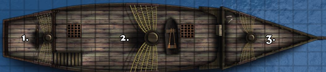
GameMastery Flip Mat: Ship