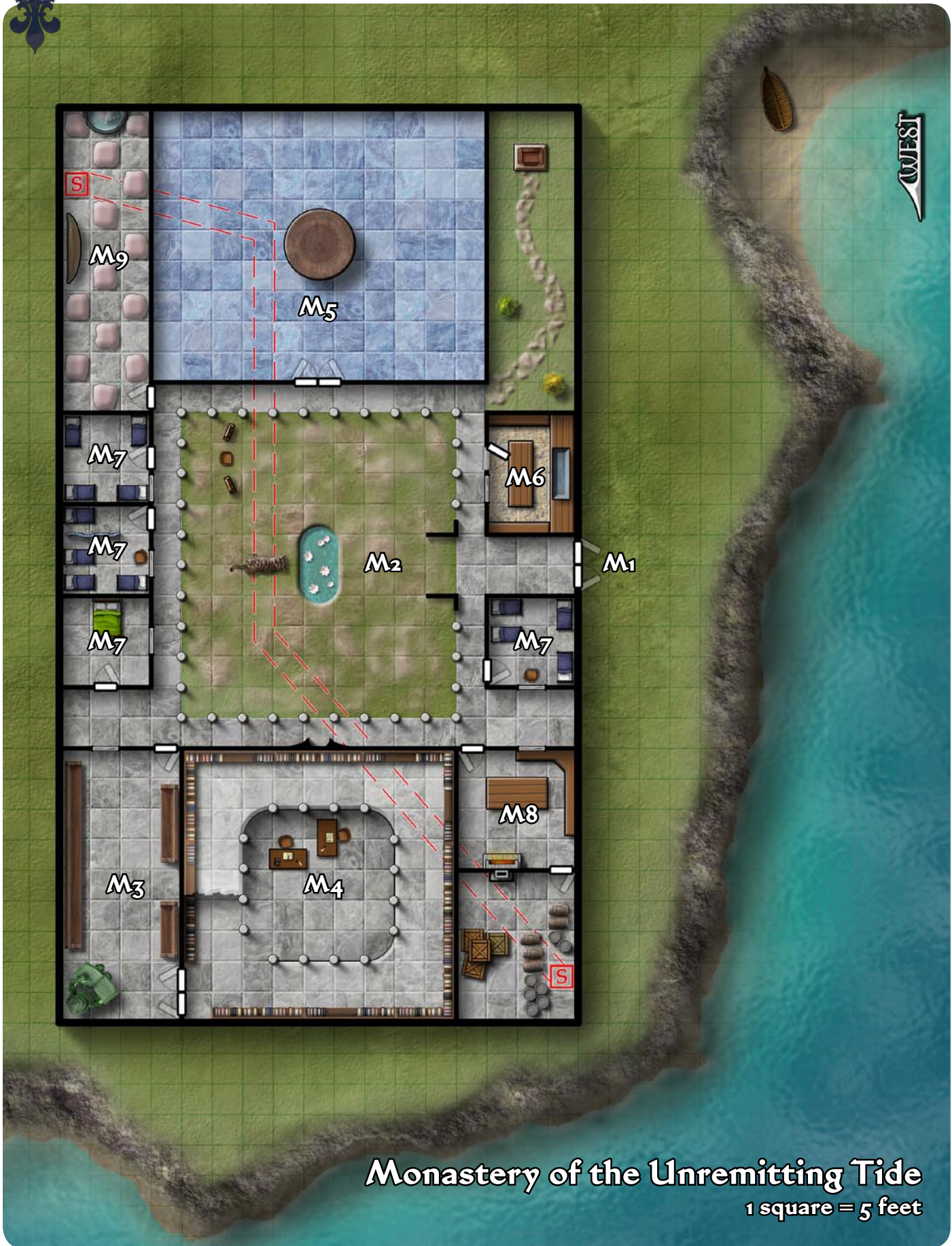
Monastery of the Unremitting Tide 1 square = 5 feet